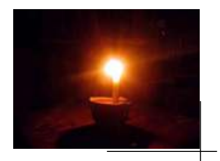
Contentment is the greatest wealth. More than just providing deeper happiness, contentment is an important step towards enlightenment